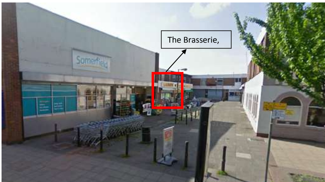
11 Victoria Parade, Urmston (facing on to Atkinson Road)